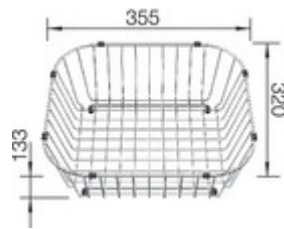
Crockery basket 514238